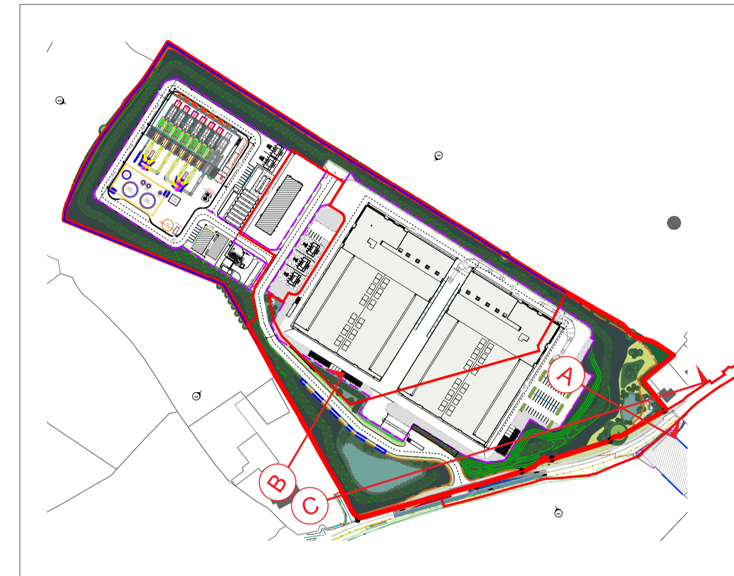
Key Plan | NTS